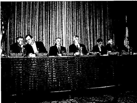
2000 Annual Meeting.

Pacific Rim countries: China, Korea, Russia, Canada, U.S., and Japan. PICES conducts environmental research in the Pacific. This agreement formalizes the cooperative relationship between the two agencies, providing for continuity in research and the possibility for pooling some of the IPHC's scientific efforts with other, larger organizations.