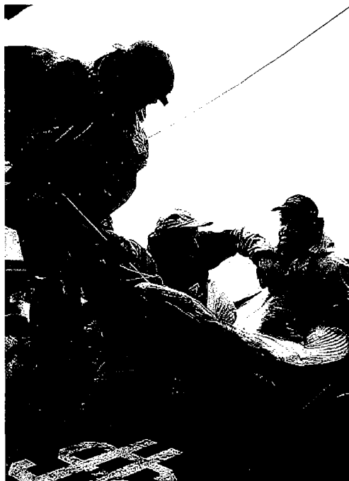
Crew hauling in a halibut on the F/V Trident .

Boundary lines for the regulatory areas, which have remained the same since 1990, are shown in Figure 1.