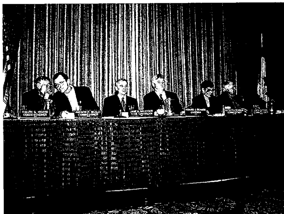
2000 Annual Meeting.

Pacific Rim countries: China, Korea, Russia, Canada, U.S., and Japan. PICES conducts environmental research in the Pacific. This agreement formalizes the cooperative relationship between the two agencies, providing for continuity in research and the possibility for pooling some of the IPHC's scientific efforts with other, larger organizations.