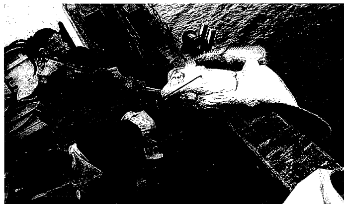
Hauling aboard a big halibut on the F/V Star Wars II .

sub-areas in Area 2B were closed to halibut fishing to protect localized stocks of a variety of species, mainly rockfishes, and to provide improved access to food fish for the Native community.