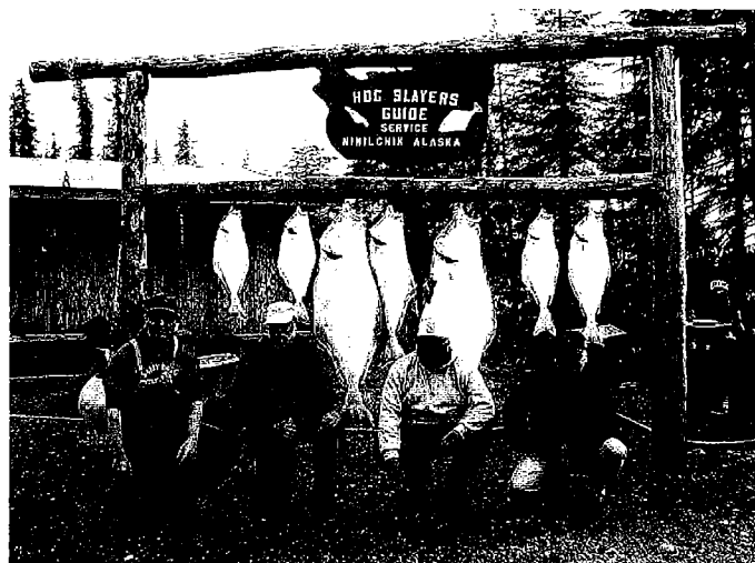
Sport fish catch in Ninilchik, Alaska.

We puzzle over how to improve the timeliness and accuracy of sport catch estimates, which we collect from a variety of sources, and which are nearly impossible to verify.