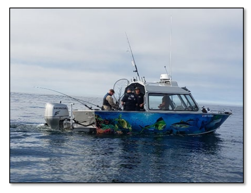
OSP Fish and Wildlife Trooper checking anglers.

Fish and Wildlife Troopers conducted an ocean patrol from Nehalem Bay to Cape Falcon. Multiple salmon, rockfish, and halibut anglers were contacted. Citations and warnings were issued for Angling Prohibited Method - Barbed Hooks for Salmon, and for Angling Prohibited Method -Treble Hooks for Salmon.