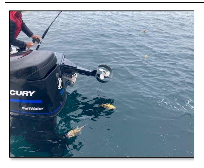
Trail of floating overlimit rockfish suspects were trying to toss overboard as officers approached.

Officers Wessel and Hillman patrolled Marine Area 4, and contacted vessels fishing halibut closed season as well. Anglers were cited for possessing illegal rockfish and having fish aboard in unlawful condition.