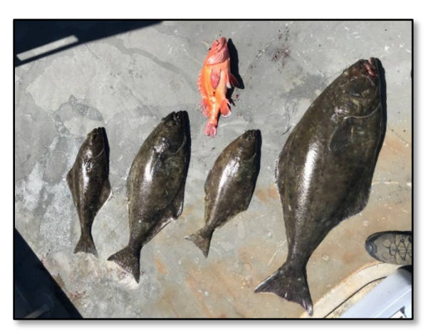
Catch from one vessel with only 2 anglers who possessed 2 halibut over their limit and a closed-area yellow eye rockfish.

Officer Davidson, Sgt. Rosenberger, and a USCG Boarding Officer performed a boat patrol in Marine Area 3 and 4. A charter vessel was observed by Officer Murray aboard a USCG helicopter actively fishing more than 20 miles offshore in a halibut hotspot on a closed halibut day. The charter boat was boarded on the water as it was leaving the location.