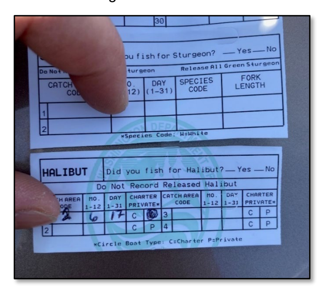
Falsified halibut catch card.