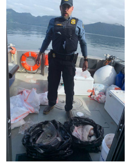
Photo: OLE checking to see if Halibut fillets were in a condition other than whole filets with skin on, in violation of IPHC Fishery Regulations §26(1)(d).