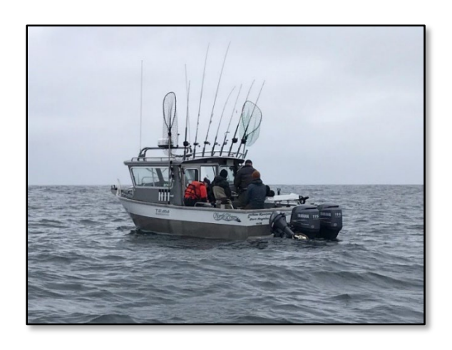
Sgt. Rosenberger and USCG boarding charter vessel.

While conducting a halibut boat patrol, Officers Baldwin and Cilk approached a recreational charter boat out of Westport. As the patrol vessel approached, the deckhand looked up at the officers, stopped filleting fish, ushered multiple anglers inside the cabin from the rear deck, and then closed the rear door. The anglers could be seen through the rear windows of the boat completing their catch record cards while the skipper on the flybridge refused to look at the patrol vessel which was travelling right beside his vessel. The officers were finally able to get the skipper's attention and approached the vessel. The officers directed the skipper to get his deckhand's attention to stop completing catch cards and move gear blocking their approach. After several minutes, an officer was able to board and discussed the blatant violations. The deckhand was cited for failing to record his catch, and both he and the skipper were warned for the obstruction and failing to complete their catch record cards. After clearing the contact, the officers determined that the charter was not listed as a current holder of a federal license to charter for recreational halibut. Further investigation into the charter's legal status was conducted and relevant charges were forwarded to NOAA OLE.