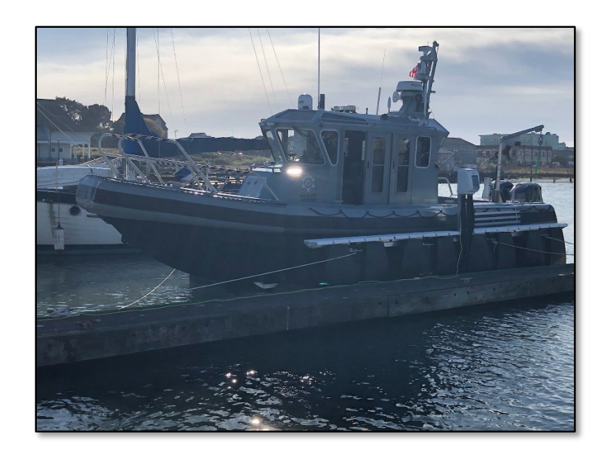
CDFW's 38' patrol boat utilized for enforcement of offshore fisheries in the Eureka area. The vessel was purchased with CDFW and NOAA Joint Enforcement Agreement (JEA) funding, and is docked at the Woodley Island Marina in Eureka.